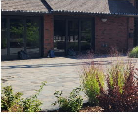
New outdoor patio space for fellowship