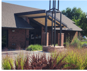
Redesigned entrances for clarity and flow