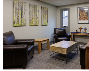
More spacious hallways, rooms and waiting spaces